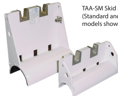
TAA-SM Skid Mount (Standard and Hi-Lift models shown)

This system can be used with analog or digital microwave transmit systems such as a BMT75/85 Series Transmitter or the Heli-Coder System.