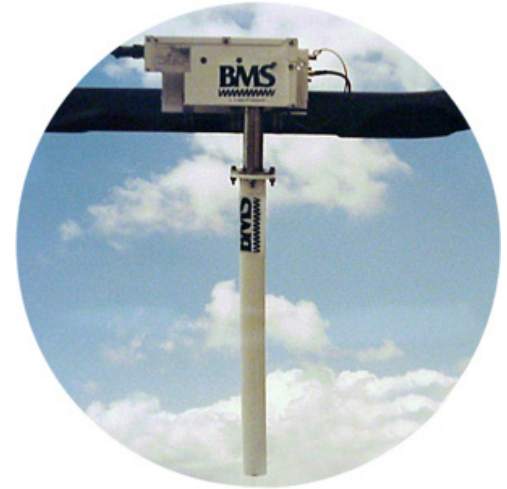
TAA-101-S shown with model BMA-6-O omni-antenna