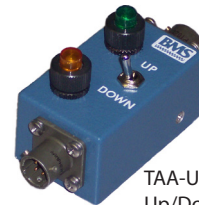
TAA-U/D Up/Down Box Controller