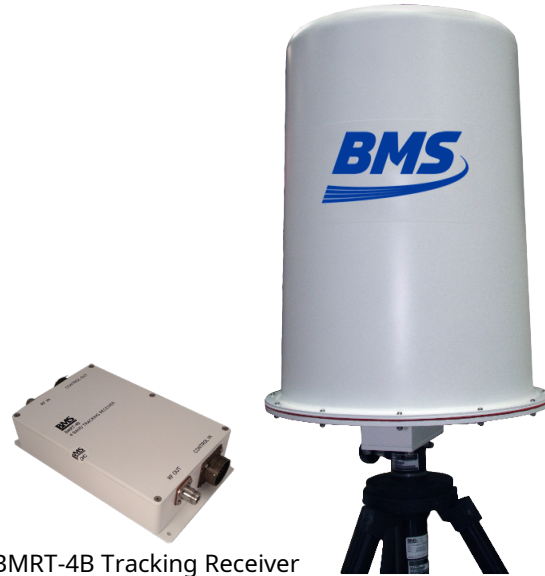
BMRT-4B Tracking Receiver

The control PC requires a serial port, a USB-to-Serial adapter or an Ethernet connector to each antenna under control.